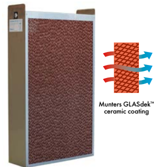
Munters GLASdek GX40

GLASdek GX40 is provided in cassettes that are tailored for use with the FA6™ frame system. FA6 comes in a wide range of standard sizes that conform to all typical air handling unit dimensions.