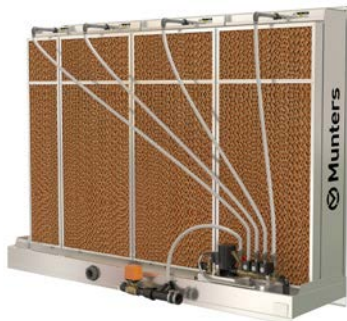
GX40 media assembled in Munters FA6™ humidifier.

FA6 guarantees optimal cooling performance thanks to low pressure drop, low operational costs and no risk of over-saturation. Also the system is completely safe and hygienic. It is certified to ISO 9001, and the modular nature of the system means it's easy to install, service and clean.